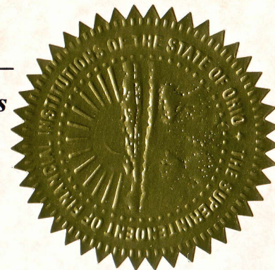
Superintendent of Financial Institutions

A handwritten signature in blue ink, appearing to read "J. B. L.", written over a horizontal line.